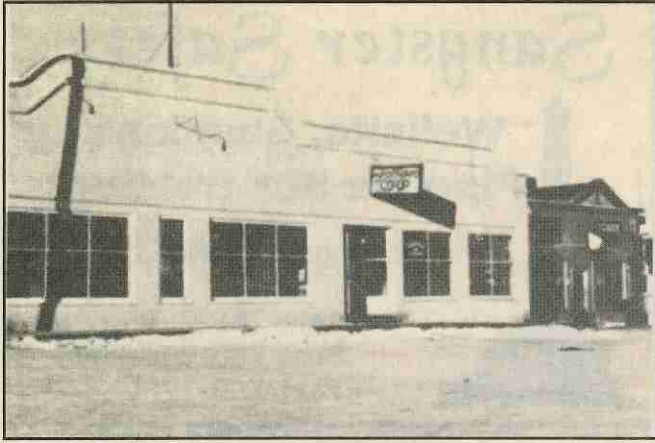
Mayerthorpe Co-op Store with the Case dealership on the right. Photo taken 1946.